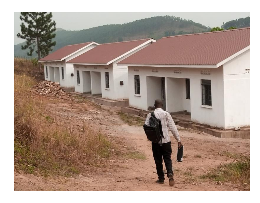
Newly constructed classroom block at Kyeyitabya P/S (Left) and Teachers quarters at Katoma SS.