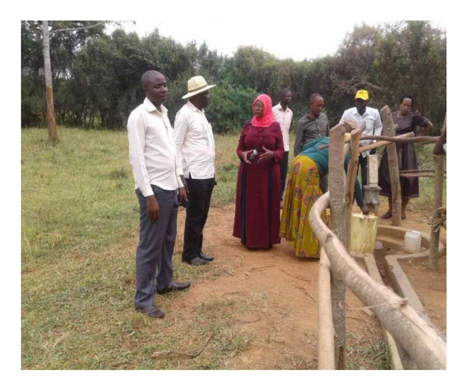
District top leaders inspect water sources in communities.