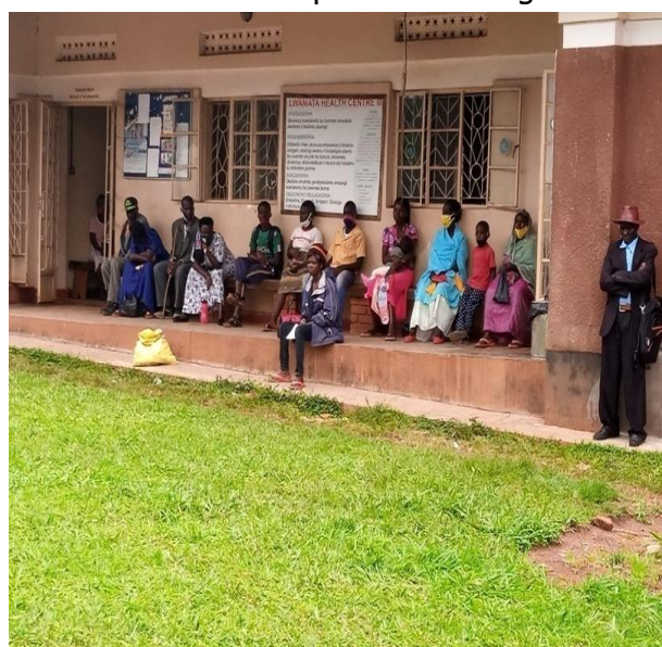
Patients wait to be attended to at Lwamata Health Centre III.