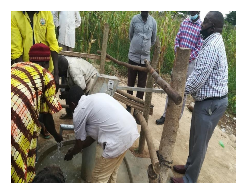
Commissioning of Kalungu Borehole