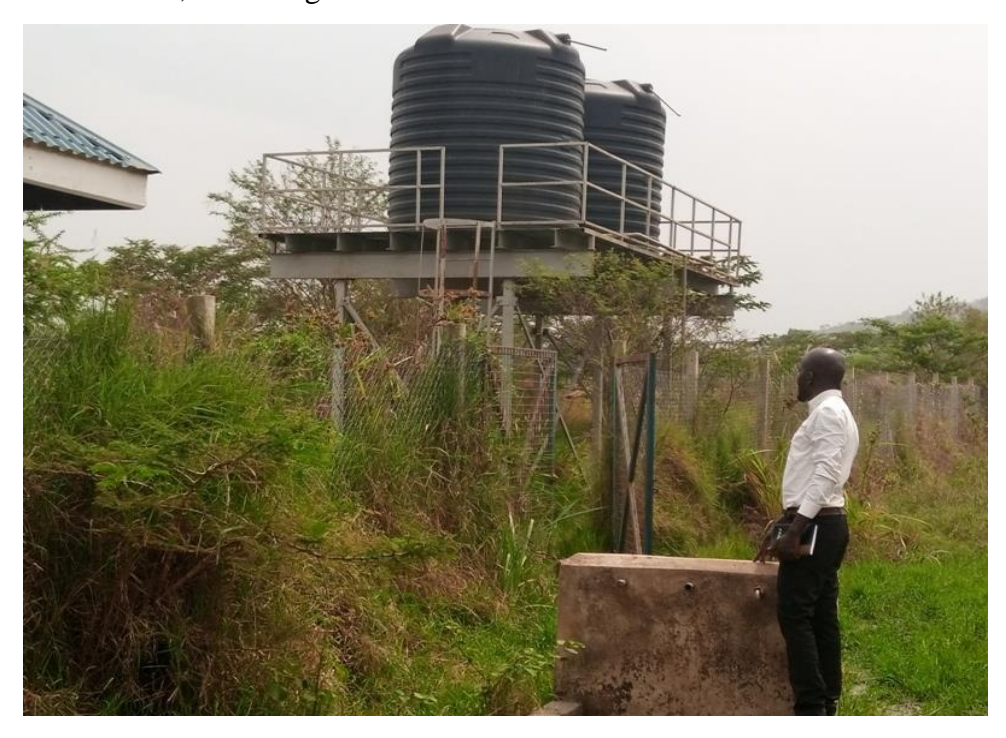
Bugabo Livestock Dam constructed to support cattle farming in dry hit areas.

achievements, challenges encountered and recommendations for future interventions.