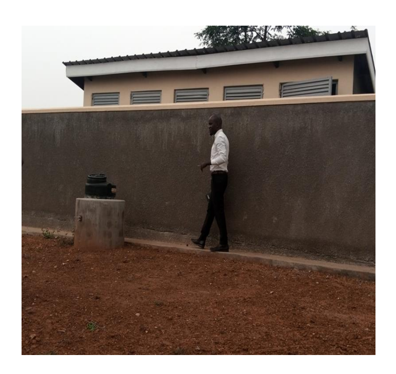
A newly constructed 5 stance pitlatrine at Muyenje Health CentreII